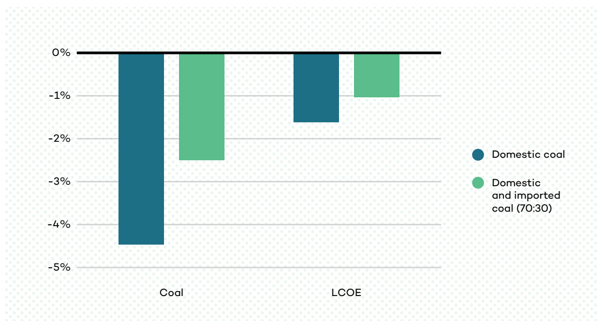
Figure 3. Percentage change in the variable LCOE for coal thermal power plants using different shares of domestic coal and imported coal

Overall, the variable LCOE of a coal thermal power plant—assuming that it uses only domestic coal—decreased by almost 1.6 per cent post-GST reform. Plants using a mix of domestic and imported coal would see a smaller decrease, 1 per cent, largely due to the influence of higher taxes on imported coal. Figure 3 shows the percentage reductions in the coal component of the LCOE as well as the reduction in the overall LCOE.