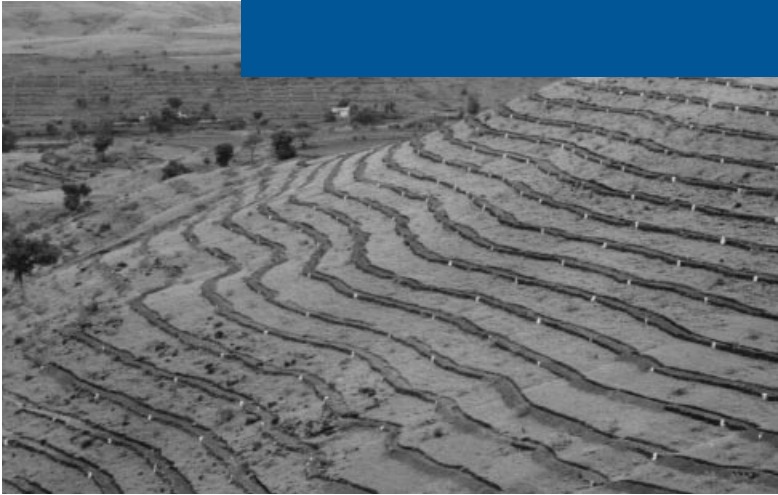
Continuous contour trenches, Chincholi, India (December 1998).

In this section, we define the core concepts needed to understand how poor and vulnerable communities are able to adapt to variable and changing climate patterns. Indeed, even this first sentence contains several concepts that need to be explained very clearly if we are to see more light and less heat in this debate. As stated earlier, clarity is needed in part because the issues we discuss here have traditionally been discussed by four distinct communities: