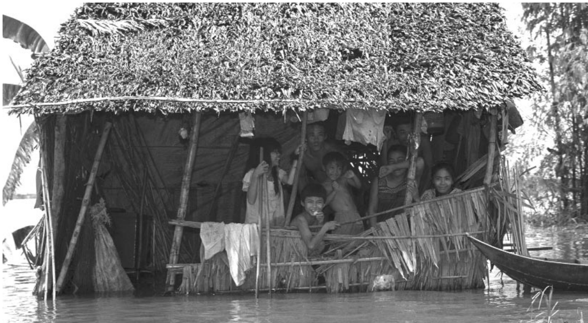
Vietnam Mekong Delta floods (November 2000).

But if we are really to see adaptation on the scale needed and effectively targeted to the specific needs and capabilities of poor people, then this link is essential and the time to act is now.