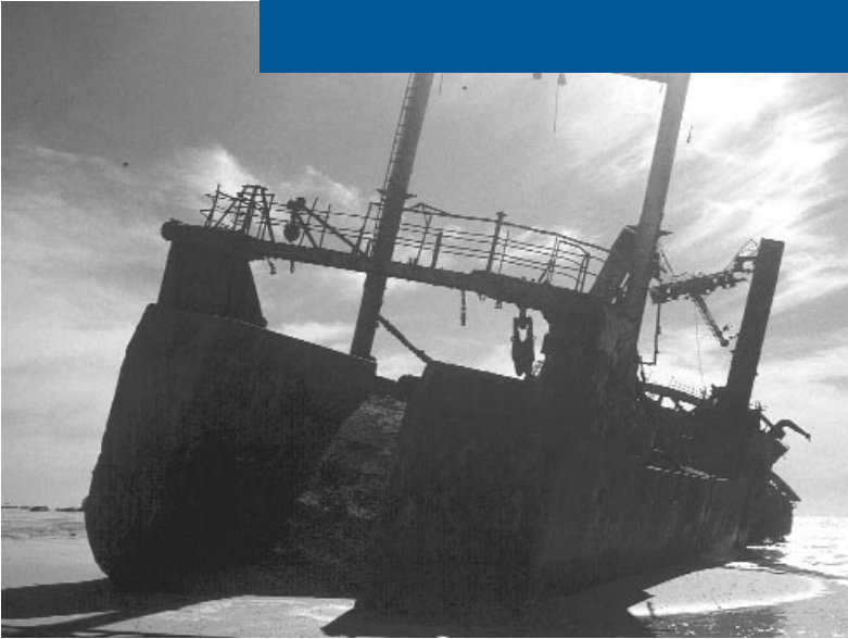
A stranded ship on the coast of Mauritania.

The key goals of adaptation strategies are to reduce vulnerability to climate-induced change and to sustain and enhance the livelihoods of poor people. These strategies consequently need to be rooted in an understanding of how the poor and vulnerable sustain their livelihoods, the role of natural resources in livelihood activities and the scope for adaptation actions that reduce vulnerabilities and increase the resilience of poor people. This is not as straightforward as it sounds, for the effects of climate change are just one of the many factors that influence people's livelihoods. This section develops these ideas further, relating the dynamics of livelihoods to the vulnerabilities that climate change is likely to bring.