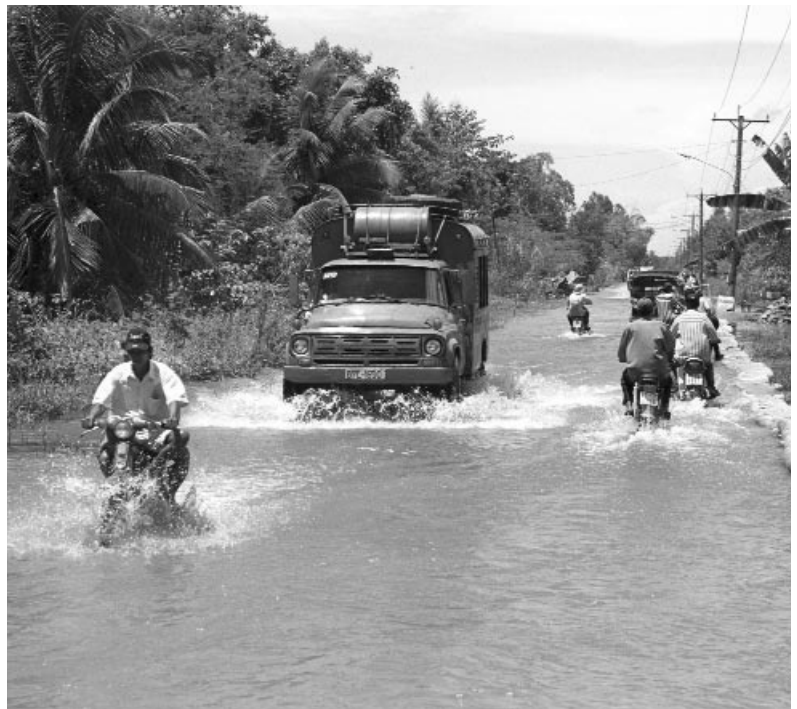
Vietnam Makong Delta Floods (November 2000).

Adaptation is not proposed as a panacea for the world's ills. We are convinced that it does offer a new opening to revisit some long-standing problems of environment and development in an innovative way. The consortium of organizations involved in this initiative is committed to the vigorous pursuit of this opportunity and invites others to engage in the effort.