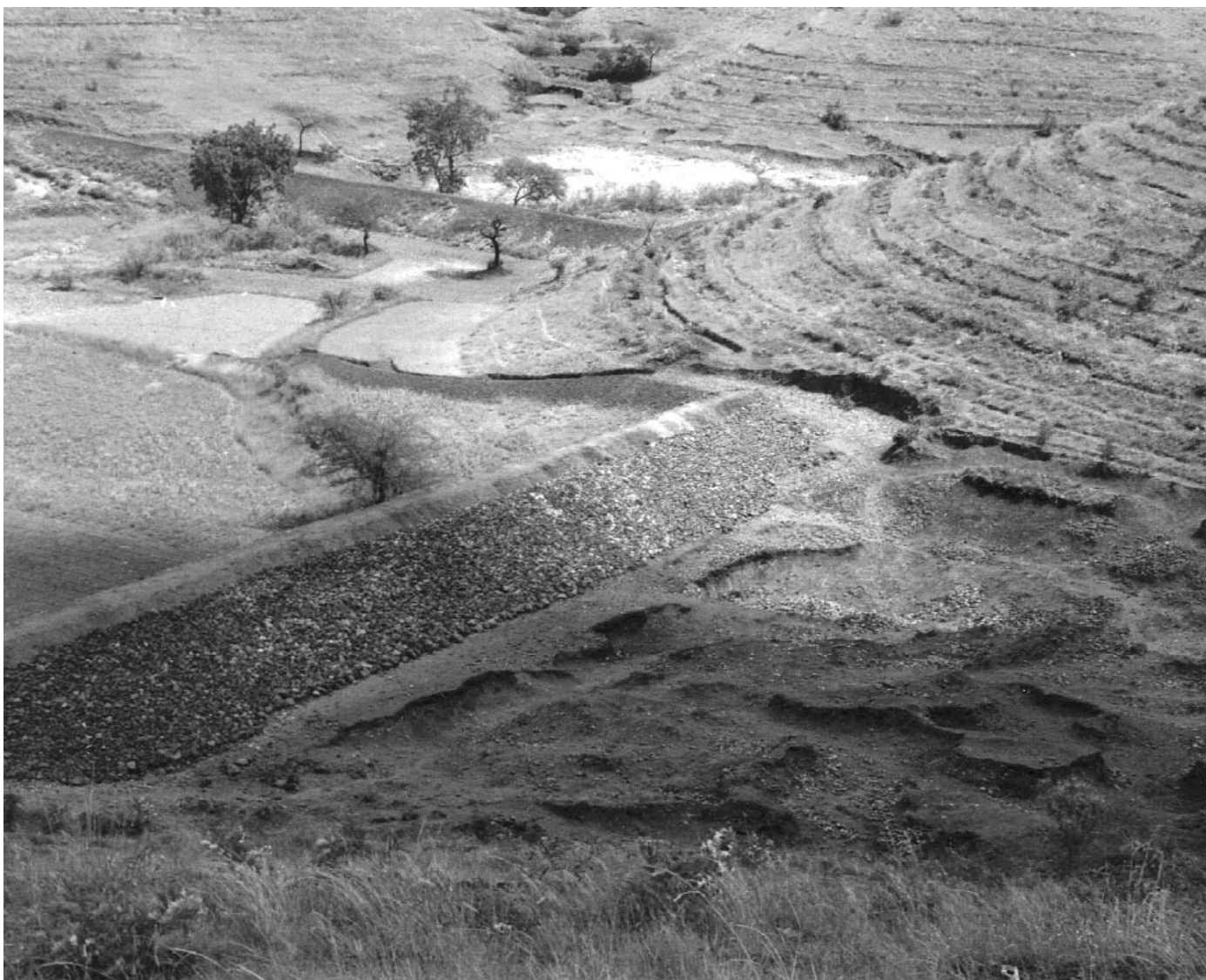
Nala Bund, Chincholi village, India (October 1997).