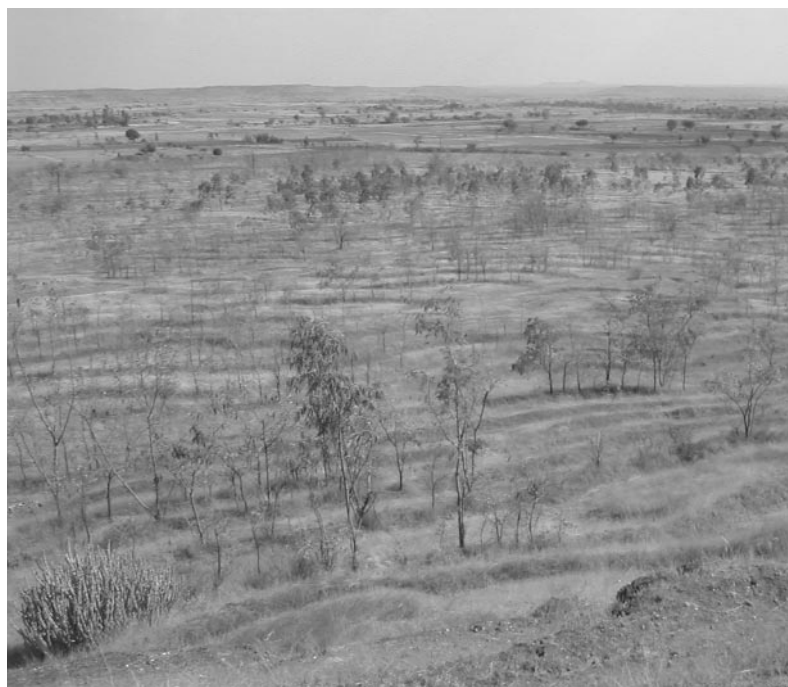
Continuous contour trenches with plantation in the dry month of February after 2 years of drought, Darewadi, India (2003).

These objectives will be met through a three-year work program involving analysis, consultations, and policy and advocacy efforts. This paper serves as an introduction to the Task Force's program, elucidating the conceptual underpinnings that inform its activities. Broadly speaking, we situate the IUCN/IISD/SEI initiative within the ongoing climate change adaptation debates and identify the institutional niche we seek to fill.