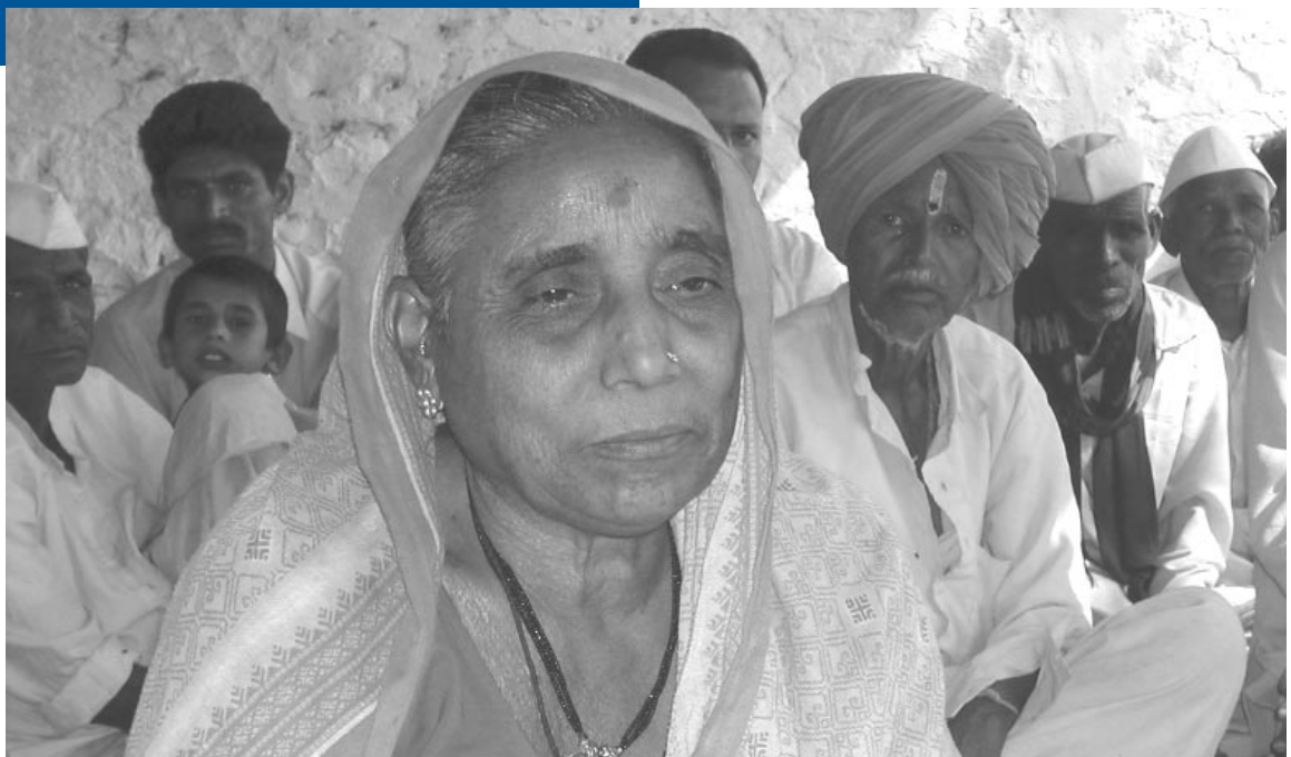
Village watershed committee meeting, Darewadi, India (February 2003).

All of these initiatives are attempting to define their own approaches and methodology. In developing these frameworks, there is a recognized danger that a classic top-down approach will emerge in which adaptation measures are equated with large-scale infrastructure-based interventions associated with physical protection. There will without doubt be many circumstances where large investments in infrastructure are an essential part of the adaptation process, but more focus is needed on non-structural alternatives. In particular, “bottom-up” approaches that are rooted in existing community-based patterns of resource management and that aim at sustaining and enhancing the livelihoods of vulnerable people have not been sufficiently recognized. We believe that these “grass-roots” initiatives should be the point of departure for the identification and assessment of adaptation strategies, as they are cheaper, more sustainable and, in many cases, more effective in achieving the