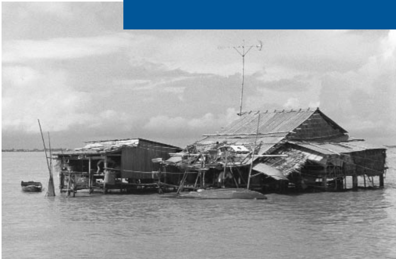
Vietnam Mekong Delta floods (November 2000).

The discussion so far has shown that peoples' livelihoods are dynamic, complex and variable in character, with the poor in particular responding with the means they have available to the vulnerabilities they face. The development of adaptation strategies to reduce the impacts of climate change on these people should reflect these dynamics of peoples' livelihoods, working in particular to reduce the vulnerabilities they face and to strengthen their resilience. This can only be achieved where adaptation is seen as a process that is itself adaptive and flexible to address the locally-specific and changing circumstances that are the reality of the lives of the poor.