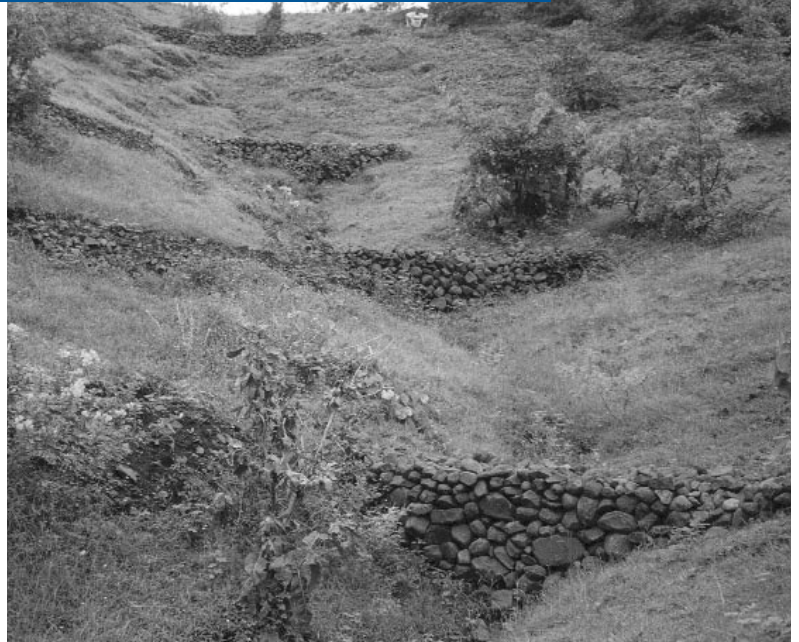
Gully plugs, Nagzari, India (October 1999).